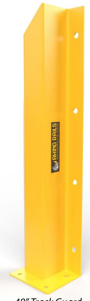
48" Track Guard