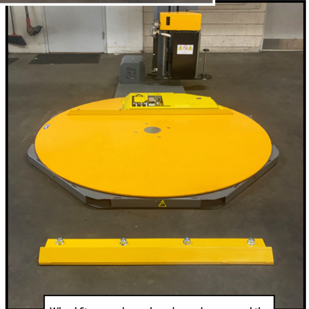
Wheel Stops can be anchored anywhere around the turntable to provide protection wherever it's needed