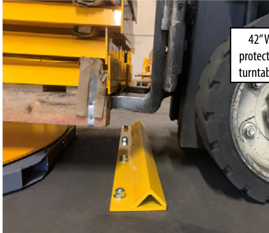
42" Wheel Stop shown protecting stretch wrapper turntable from forklift tires

This durable & long-lasting piece can save thousands of dollars when factoring in repairs to damaged machines and lost production with down time.